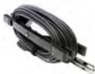
Cable Management Kit